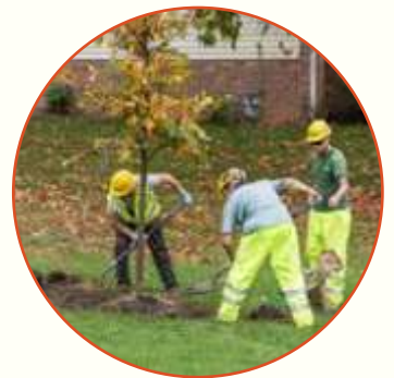
Extensive Tree plantation