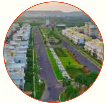
Aesthetically Designed, Gated Township