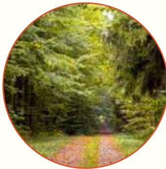
Dense Forest Parks with Walkways