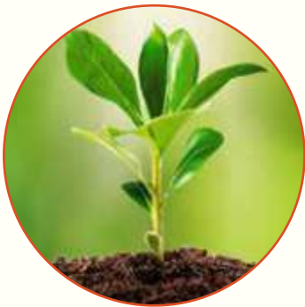
One plant per plot